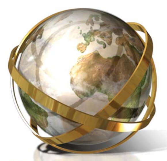
CIHR International Infectious Disease & Global Health Training Program